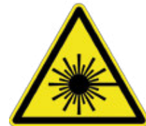
For thin sheets